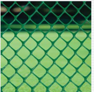
Bi-axially oriented mesh