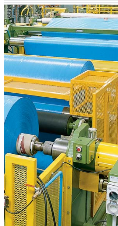
Coating line, Australia

The Company's compliance with the Principles of Good Governance and Best Practice Recommendations published by the Australian Stock Exchange Corporate Governance Council in March 2003 is described in this Annual Report including the Corporate Governance Statement, the Directors' Report and the Financial Statements. The Listing Rules of the Australian Stock Exchange require listed companies to report on the extent to which they comply with the Best Practice recommendations. The Company complies with the majority of the recommendations, and where it does not, it has indicated so in this Corporate Governance Statement. While the Board of the Company is satisfied with its level of compliance with the governance requirements, it recognises and acknowledges that the Company's practices and procedures should be constantly reviewed and improved.