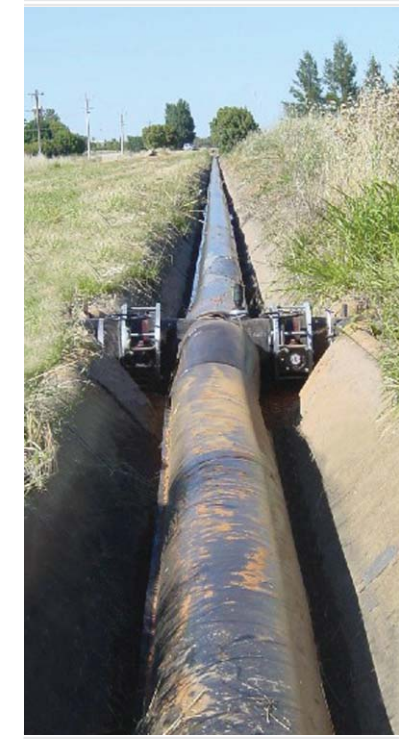
Channel liner water conservation

In determining the level and make-up of executive remuneration, the Remuneration Committee reviews reports detailing market levels of remuneration for comparable roles. Remuneration consists of fixed and variable elements.