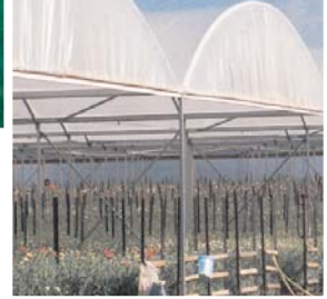
Birdnet fruit protection