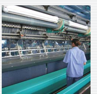
Extensive knitting capabilities

Late in the year, we succeeded in expanding the number of major retail stores stocking our standard window shades, in addition to a significant increase in stores carrying the custom shade program. Custom shades provide higher than average margins.