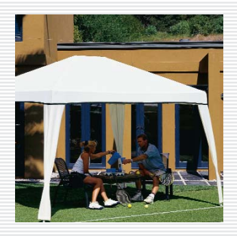
M W PRINGLE PARTNER Melbourne