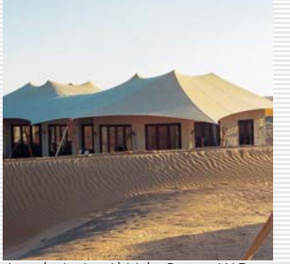
Award winning Al Maha Resort, UAE