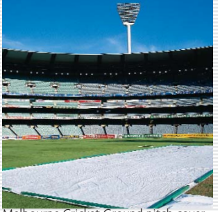
Melbourne Cricket Ground pitch cover