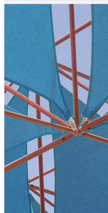
Advanced fabric technology enhances architectural freedom