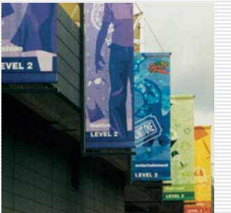
Printed banner fabrics